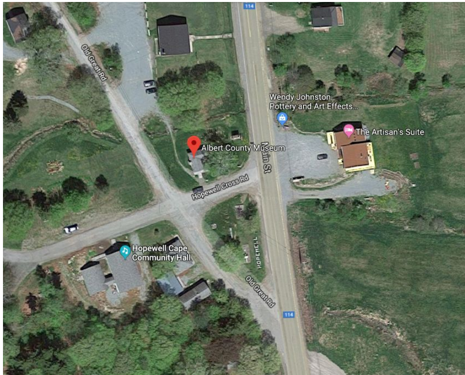
Hopewell Cape, NB E4H 3J8

Artifacts and information relating to the Albert County Mine and albertite are presented to the public at the Albert County Museum in Hopewell Cape, NB